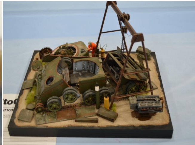
As Jon said, NEW CATEGORY for 2020